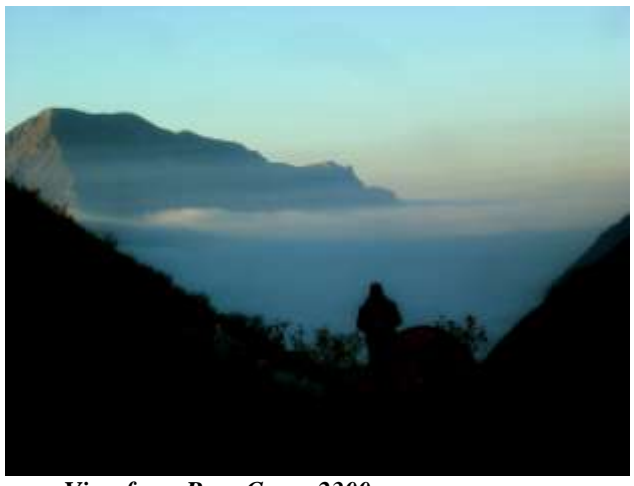
View from Base Camp 2300m

Day 3. Starting at this day all common luggage (tent, food, ropes) will carry by ourselves. We climb up to the start of the Maily glacier (2450 m) through moraine ridge. We must be careful because glacier is open. Sometimes we need to use crampons. There are some steep places after 2770m altitude and maybe we will use fixed rope (approximately 100 meters of way). There is not so steep slope after (average slope of 32 degrees) but we must be concentrating at climbing too. Beautifully-facing Camp1 place at 3400 m, rewarded our hard all-day's work. There is a greatest view to crevasses of Maily glacier and all circuses of mountains with highest point Djimara Peak (4780m) from Camp 1. In evening time we may see lights of Tmenikau village and Vladikavkaz city. Tent camp.