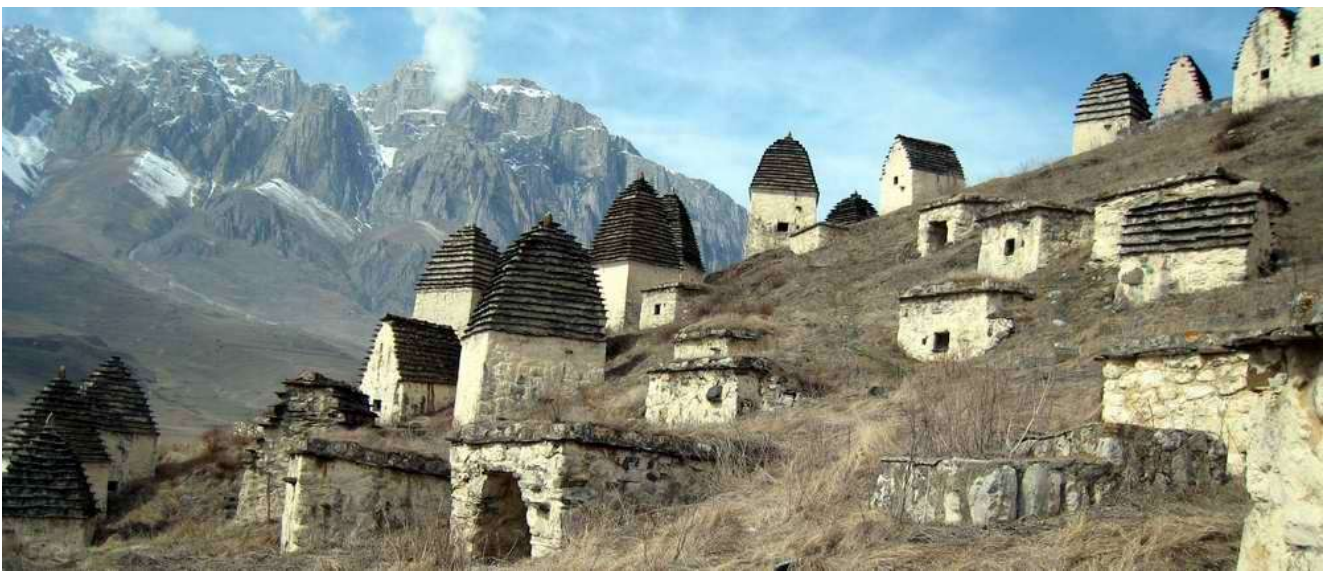
Necropolis of Dargavs city