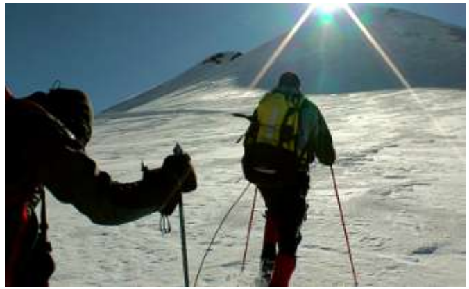
Under Kazbek slope