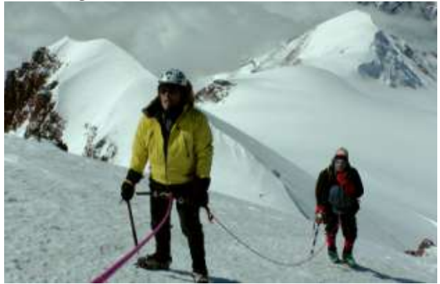
Last pitch before the summit