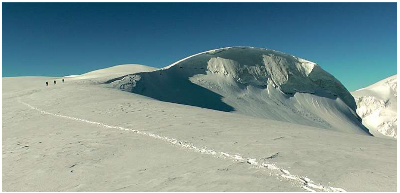
At the top of Maily pass 4400m

Day 5. Summit day! After breakfast inside the tent we take on our harness and crampons. After two hours by Maily plateau we are reached to rocky head of Maily pass 4400m (30 degrees of slope maximum). Perfect view to all Kazbek plateau and our goal for today. Small descent from pass and cross the Kazbek plateau straight to the Kazbeksky pass 4480m. This point brings together Russian and Georgian ascent route, actual summit climb takes place on the exact same route. We still cross a glacier, and after almost 3 hours to reach the "gateway" to the summit. The Mt.Kazbek consists of the small 4890m and the large Kazbek with 5033m. We traverse the back of the small Kazbek along the 30 to 35 degrees sloping ice field (in the snow takes longer) to the saddle direction 4800 m. The last part of slope (10 m high ice / snowdrift) quite steep, where we should go very cautiously. A rest before the final challenge of the very steep and sometimes bare summit ice cap. In the steep ice slope with crampons and partly through rocky passages, we are climbing our final part of way up. Sometimes we need to mobilized all our forces for crossing this ice part(maybe we put a fixed rope) and then it's TOP - the most eastern five thousand meters peak of the Caucasus rewarded us with a wonderful panoramic view of of Central and Eastern Caucasus! At the clean weather we can see another volcano, a giant of the Caucasus - Elbrus (5642 m).