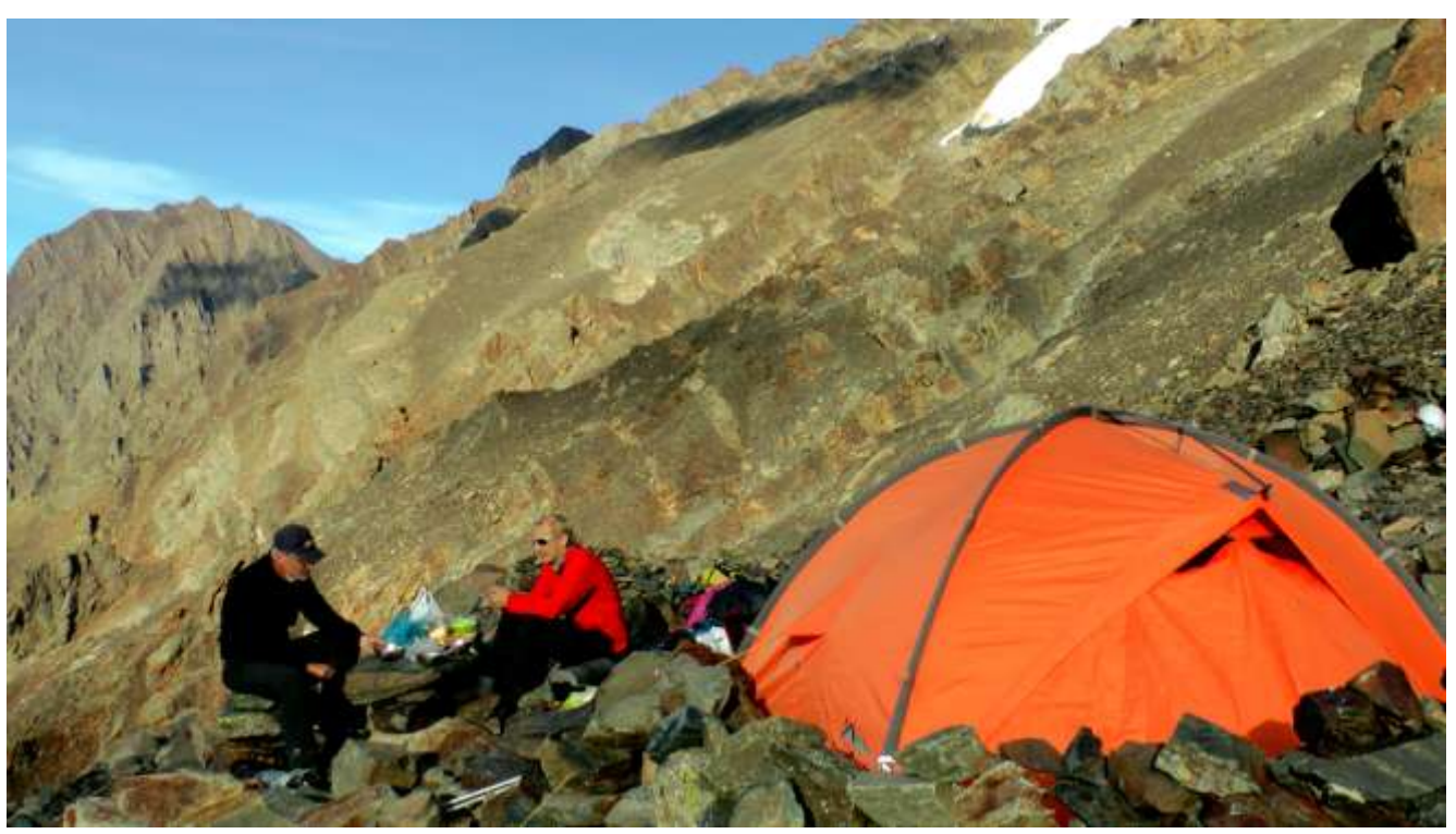
Camp1, 3400 m