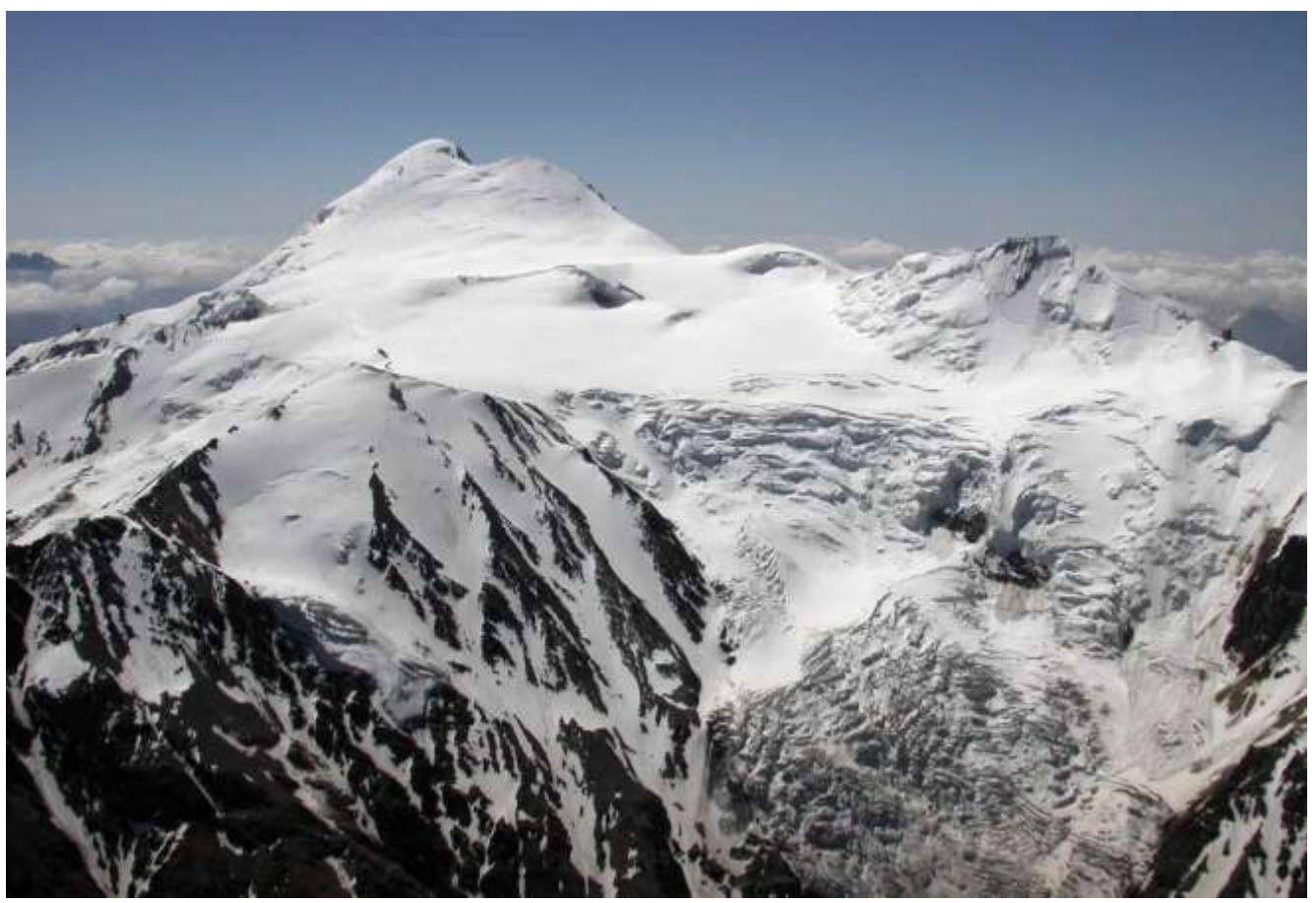
View of Maily glacier and North face Mt.Kazbek

Day 4. Today we have 3-4 hours of climbing way by quite steep (sometimes 60 degrees) stone-cowered slope. Some parts of trail are covered by snow (depends at season). There is only 3km of way but we must be concentrated all the time. After some rest time we have 30min. walking to Polyakov peak 4270m. There is great view to Chach glacier (Georgia side) and shapely twin-peaks of Kazbek, which we will hopefully be rewarded with a glowing sunset. Camp2 place 4150m situated on the big stone moraine near the Maily glacier from where we will take fresh water.