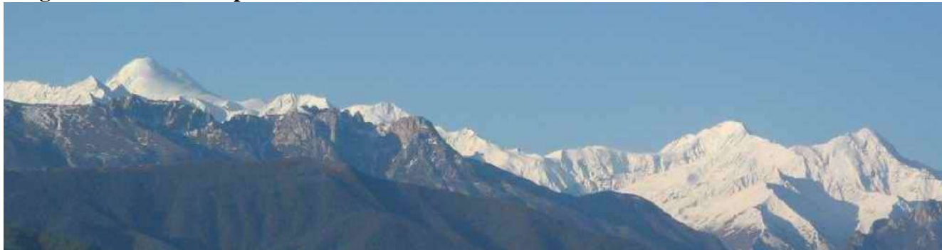
Kazbek-Djimarai, view from Vladikavkaz hotel

Day 1. Flight to Vladikavkaz, arrival. Transfer to Tmenikau village. By the way great views of old families towers and also we are visit the necropolis of Dargavs city (special stone houses city for dead people with pyramidal roofs piled by stone). Tree hours trekking to Base Camp 2300m. Main equipments carry up by mules and we can still travel with light luggage. Close from the Base Camp there are 2 natural hot mineral water springs with bathes. Tent Camp.