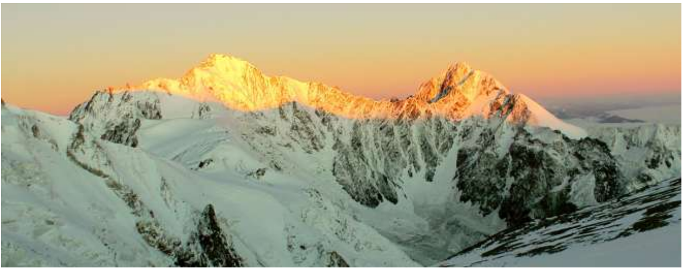
Morning view to Djimara 4780m and Shau-hoh peaks 4638m from Camp2 4150m